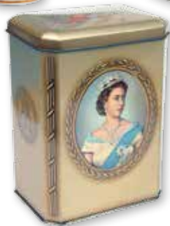
It was a cause for nationwide celebration, with millions joining in any way they could.