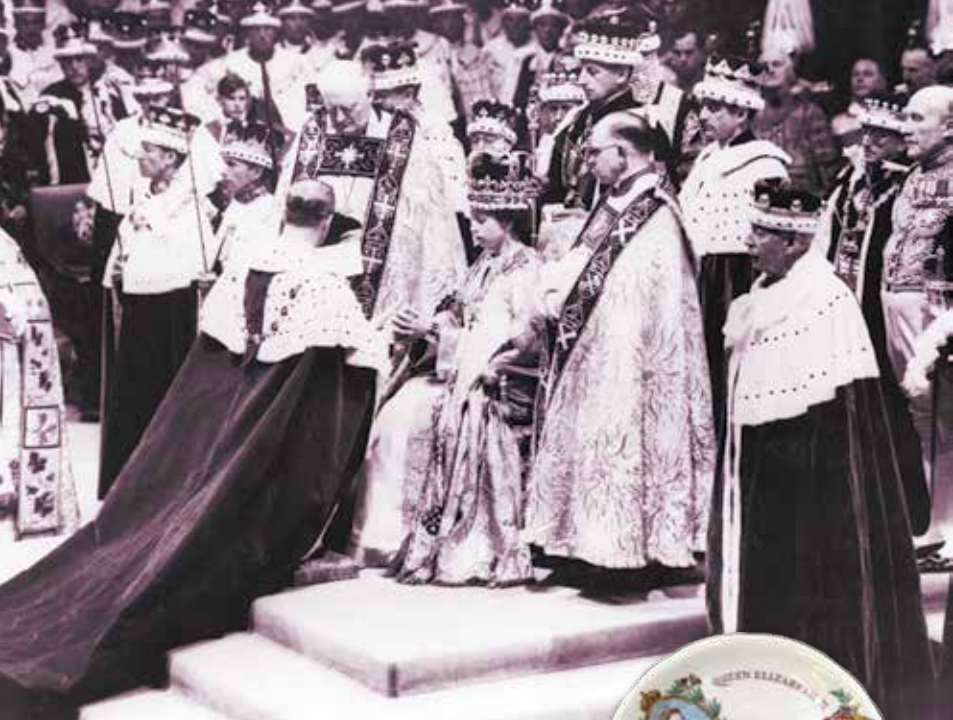
The coronation was attended by a crowd of 7,500 dignitaries, politicians and notable peers.