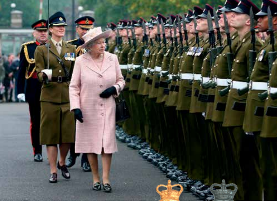
A military parade – just one part of Her Majesty’s role in the forces.