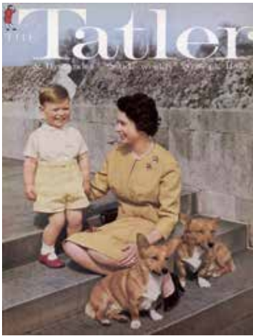
All aspects of the royal family's life are the subject of public interest, right down to the famous corgis.