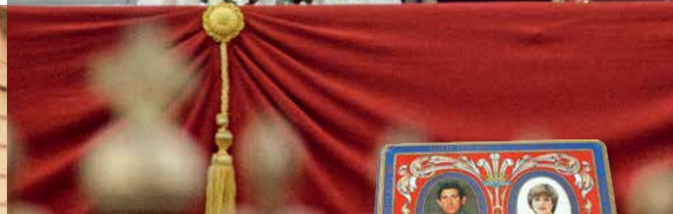
Prince Charles married Lady Diana Spencer to scenes of jubilation on 29 June 1981.