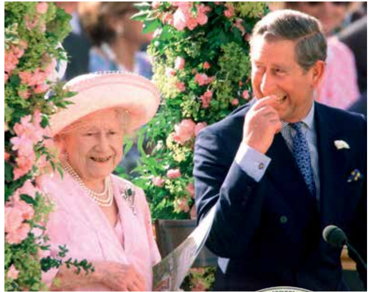
The Queen Mother shares a joke with Prince Charles during a pageant to celebrate her 100th birthday.